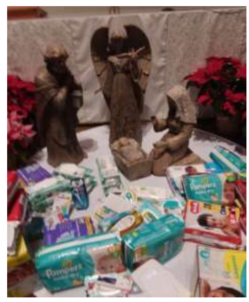
Lots of donations for the Stork's Nest to support little ones in our community!