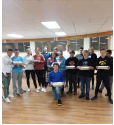
Freezer casserole meals made for Hope Ministries, Des Moines!