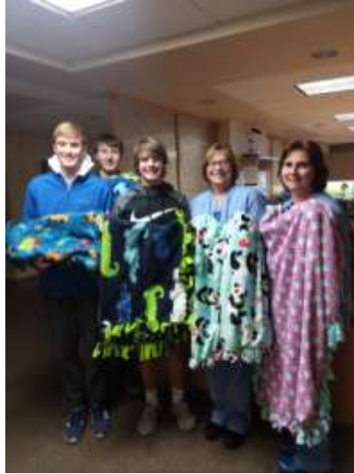
Fleece blankets made for the hospital nursery!