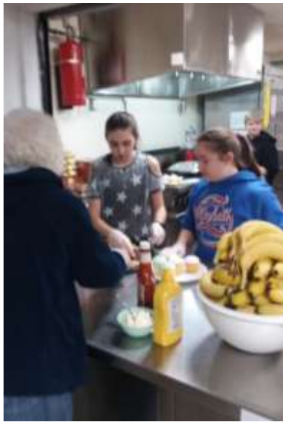
Happy to serve a good meal at House of Compassion!