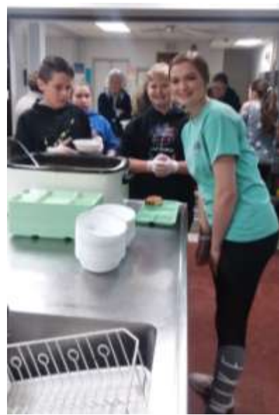
Hot soup served on a cold night at the Soup Kitchen!