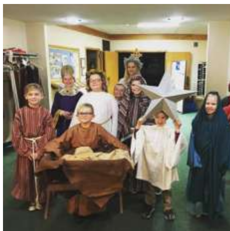
Children's Nativity Procession prepares to offer their blessing to the congregation!